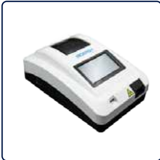
YR-10 Desktop Reader